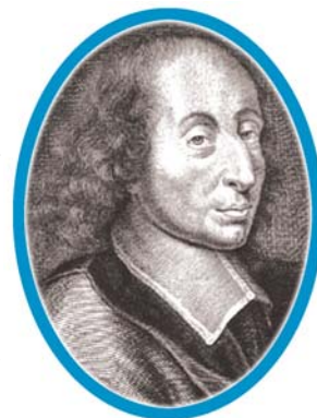
Blaise Pascal (1623-1662)

In earlier classes, we have learnt how to find the squares and cubes of binomials like a + b and a - b . Using them, we could evaluate the numerical values of numbers like (98)^2 = (100 - 2)^2 , (999)^3 = (1000 - 1)^3 , etc. However, for higher powers like (98)^5 , (101)^6 , etc., the calculations become difficult by using repeated multiplication. This difficulty was overcome by a theorem known as binomial theorem. It gives an easier way to expand (a + b)^n , where n is an integer or a rational number. In this Chapter, we study binomial theorem for positive integral indices only.