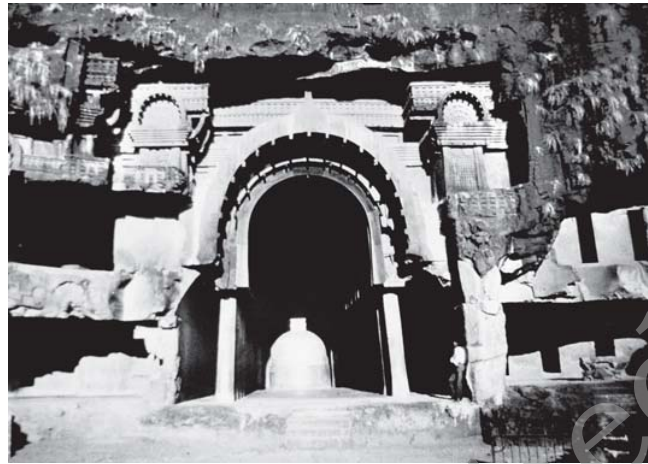
A cave at Karle, Maharashtra

Read page 100 once more. Can you think of how Buddhism spread to these lands?