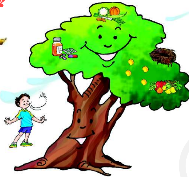
Picture 1 I give you all this

Look at the two pictures. Find four things that are different about these trees and talk about them.