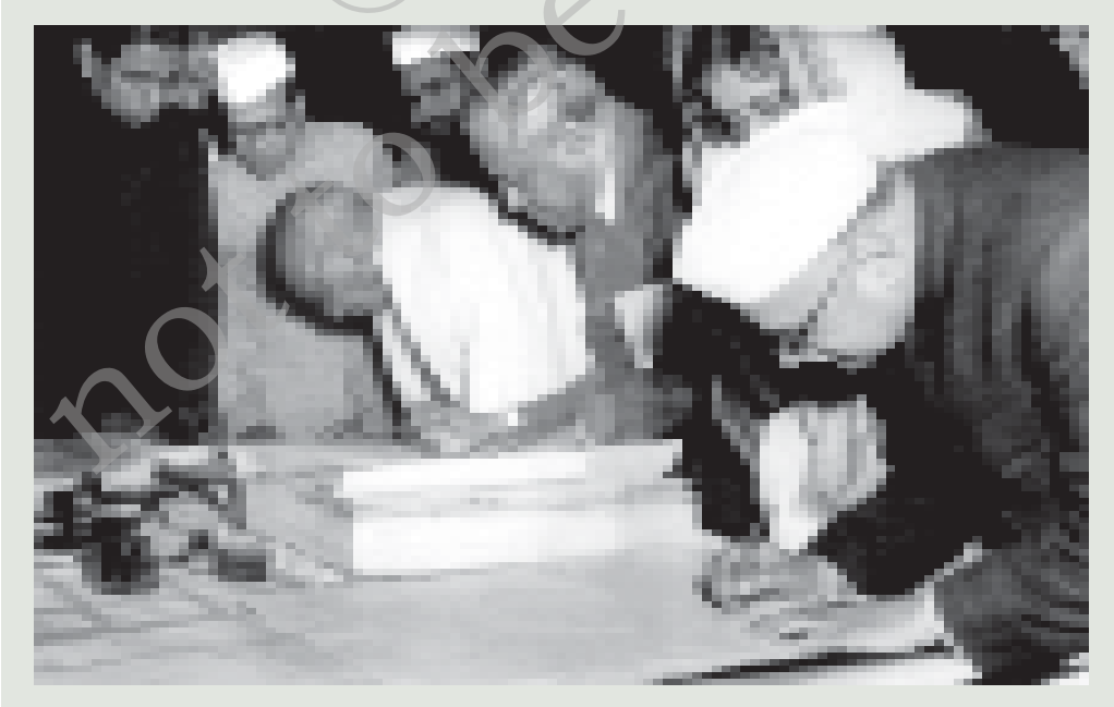
Fig. 15.1 The Constitution was signed in December 1949 after three years of debate.

The Constitution of India was framed between December 1946 and December 1949. During this time its drafts were discussed clause by clause in the Constituent Assembly of India. In all, the Assembly