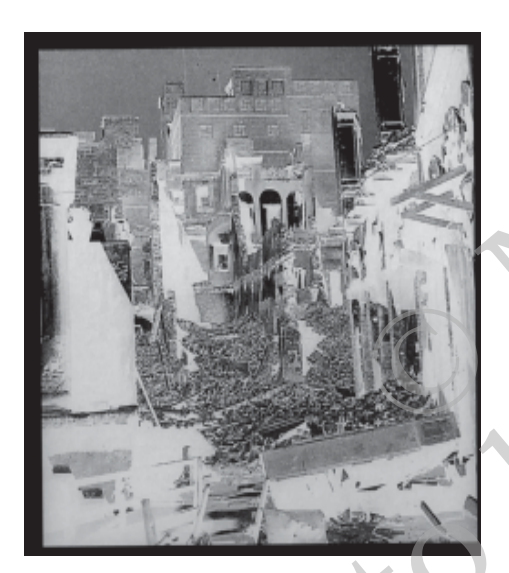
Fig. 15.2 Images of desolation and destruction continued to haunt members of the Constituent Assembly.

From your political science textbooks you know what the Constitution of India is, and you have seen how it has worked over the decades since Independence. This chapter will introduce you to the history that lies behind the Constitution, and the intense debates that were part of its making. If we try and hear the voices within the Constituent Assembly, we get an idea of the process through which the Constitution was framed and the vision of the new nation formulated.