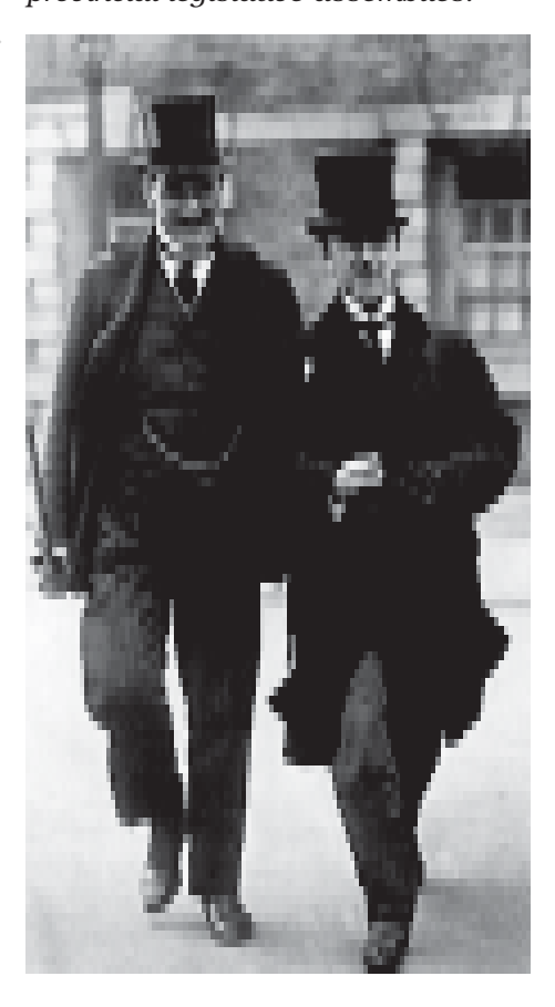
Fig. 15.7 Edwin Montague (left) was the author of the Montague-Chelmsford Reforms of 1919 which allowed some form of representation in provincial legislative assemblies.

• Why does the speaker in Source 2 think that the Constituent Assembly was under the shadow of British guns?