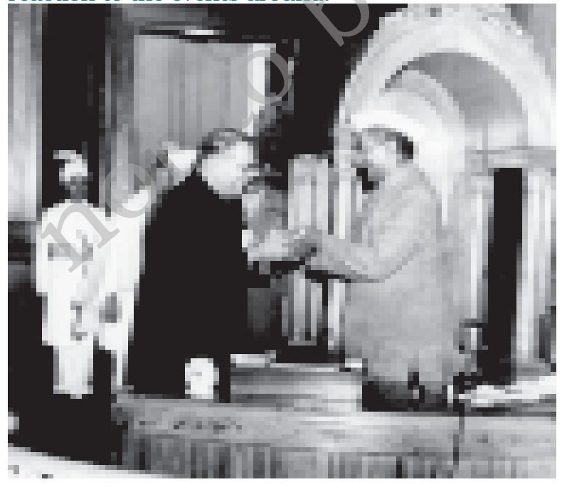
Fig. 15. 9 B. R. Ambedkar and Rajendra Prasad greeting each other at the time of the handing over of the Constitution

The Constituent Assembly debates help us understand the many conflicting voices that had to be negotiated in framing the Constitution, and the many demands that were articulated. They tell us about the ideals that were invoked and the principles that the makers of the Constitution operated with. But in reading these debates we need to be aware that the ideals invoked were very often re-worked according to what seemed appropriate within a context. At times the members of the Assembly also changed their ideas as the debate unfolded over three years. Hearing others argue, some members rethought their positions, opening their minds to contrary views, while others changed their views in reaction to the events around.