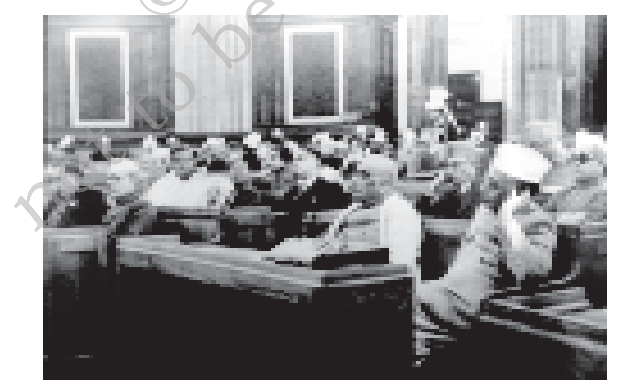
Fig. 15.4 The Constituent Assembly in session Sardar Vallabh Bhai Patel is seen sitting second from right.

The discussions within the Constituent Assembly were also influenced by the opinions expressed by the public. As the deliberations continued, the arguments were reported in newspapers, and the proposals were publicly debated. Criticisms and