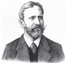
Joseph Conrad 1857-1924

Joseph Conrad, born of Polish parents in the Russian Ukraine, began a seafaring life in 1874. He learnt English at the age of 21, and in 1886 became a British citizen. His famous works include The Nigger of the Narcissus (1898), Lord Jim (1900) and Nostromo (1904). His greatest skill lies in his capacity to evoke an atmosphere through careful attention to detail. He uses the method of story within a story to convey his sense of the inexplicable inner character of life and the shifting quality of the mind. All Conrad's characters suffer from a sense of isolation.