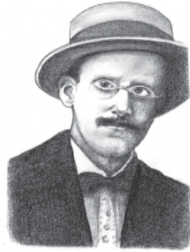
James Joyce 1882-1941

James Joyce is a major literary figure of the first quarter of the twentieth century. He is known for his bold experiments in narrative techniques in fiction, and Ulysses is his most famous work. 'Eveline' is one of the fifteen stories of Dublin life that form Dubliners, first published in 1914. It is a sympathetic portrayal of Eveline, who has within her reach escape from the drudgery of her life but cannot gather enough courage to seize it.