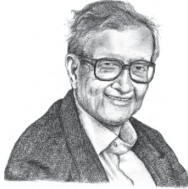
Amartya Sen Born 1933

Amartya Sen was awarded the Nobel Prize in Economics in 1998 for his contribution in the field of welfare economics. He is Lamont Professor at Harvard.