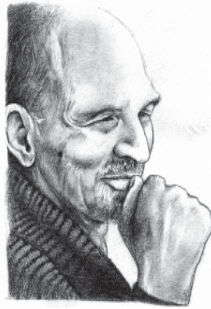
Ingmar Bergman Born 1918

Ingmar Bergman is a well known Swedish director of films noted for their starkness, their subtle use of black and white and 'shades' of those extremes, the ambiguity of their content, and a certain brooding presence that seems to pervade them all. The list of Bergman films is long; his best known include The Seventh Seal (1957), Wild Strawberries (1958), The Virgin Spring (1960), The Silence (1963), Persona (1967), The Passion of Anna (1970), and Cries and Whispers (1973)—this last film in colour, though emphasising red in all its shadings. In the following selection, the Introduction to Four Screen-plays by Ingmar Bergman (1960), Bergman discusses how he views the art of film-making.