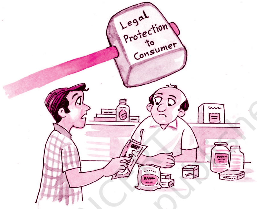
Protection against malpractices and exploitation

against defective goods, deficient services, unfair trade practices, and other forms of their exploitation. The Act provides for the setting up of a three-tier machinery, consisting of District Forums, State Commissions and the National Commission. It also provides for the formation of consumer protection councils in every District and State, and at the apex level.