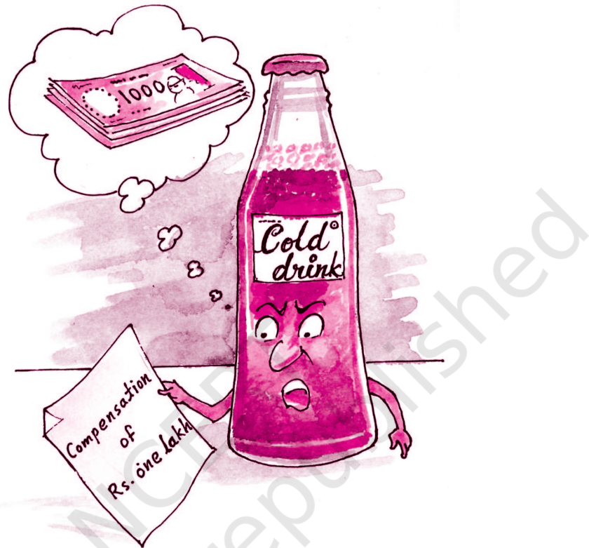
Compensation for impurities in cold drinks

themselves into consumer associations for protection and promotion of their interests. At the same time, consumer protection has a special significance for businesses too.