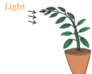
Fig. 25.2 A potted plant showing phototropism