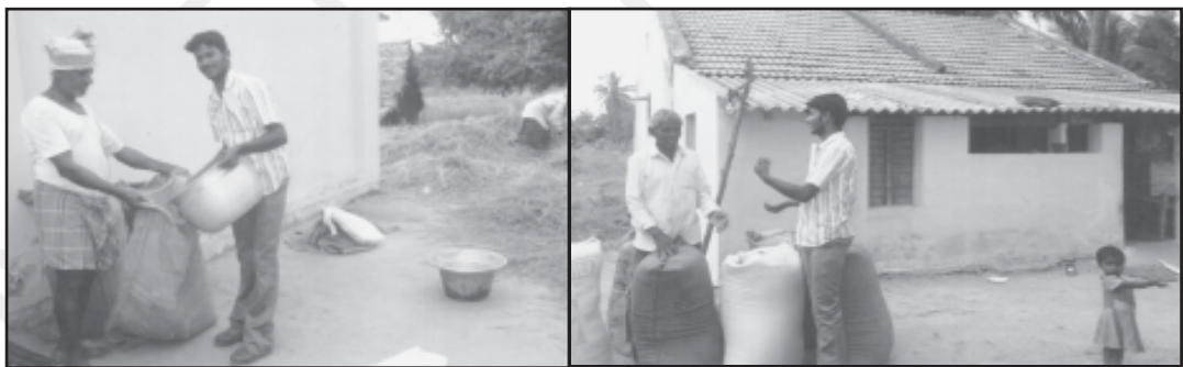
Threshing of paddy in a village