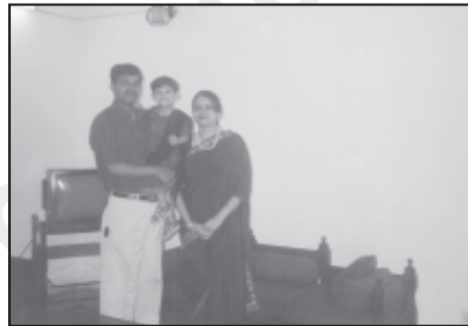
Notice how families and residences are different