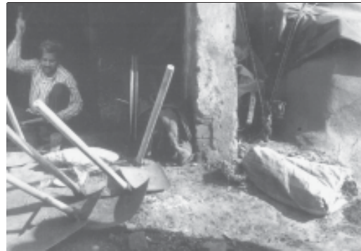
Work and Home