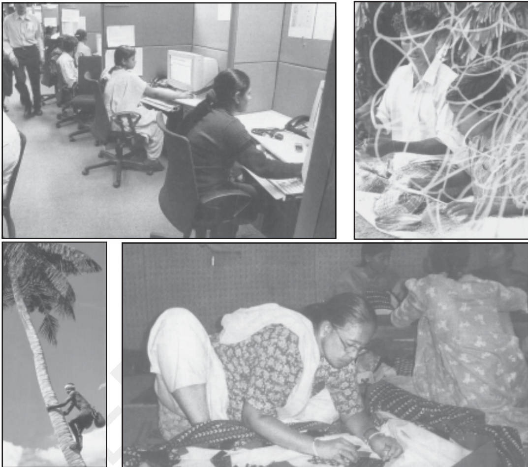
Types of Work

physical effort, which has as its objective the production of goods and services that cater to human needs.