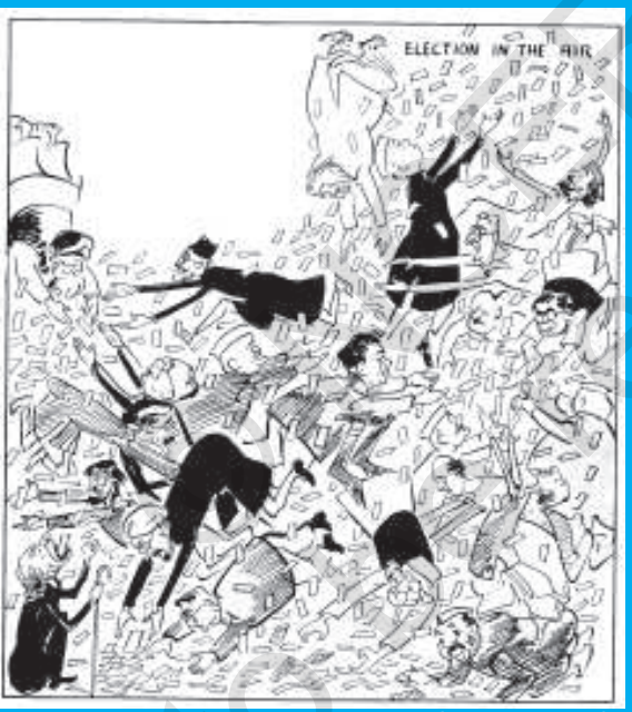
17 February 1957

They say elections are carnival of democracy. But this cartoon depicts chaos instead. Is this true of elections always? Is it good for democracy?