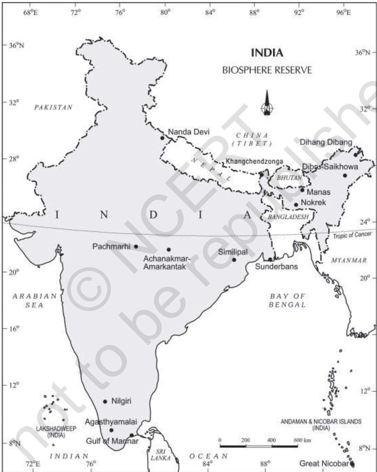
Figure 5.9 : India : Biosphere Reserves