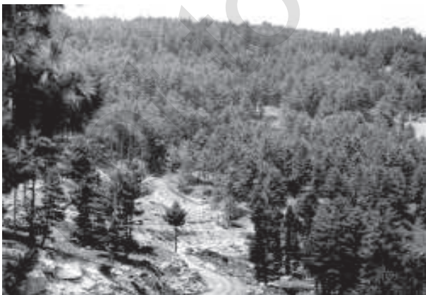
Figure 5.5 : Montane Forests

The Himalayan ranges show a succession of vegetation from the tropical to the tundra, which change in with the altitude. Deciduous forests are found in the foothills of the Himalayas. It is succeeded by the wet temperate type of forests between an altitude of 1,000-2,000 m. In the higher hill ranges of northeastern India, hilly areas of West Bengal and Uttaranchal, evergreen broad leaf trees such as oak and chestnut are predominant. Between 1,500-1,750 m, pine forests are also well-developed in this zone, with Chir Pine as a very useful commercial tree. Deodar, a highly valued endemic species grows mainly in the western part of the Himalayan range. Deodar is a durable wood mainly used in construction activity. Similarly, the chinar and the walnut, which sustain the famous Kashmir handicrafts, belong to this zone. Blue pine and spruce appear at altitudes of 2,225-3,048 m. At many places in this zone, temperate grasslands are also found. But in the higher reaches there is a transition to Alpine forests and pastures. Silver firs, junipers, pines, birch and rhododendrons, etc. occur between 3,000-4,000 m. However, these pastures are used extensively for transhumance by tribes like the Gujjars, the Bakarwals, the Bhotiyas and the Gaddis. The southern slopes of the Himalayas carry a thicker vegetation cover because of relatively higher precipitation than the drier north-facing slopes. At higher altitudes, mosses and lichens form part of the tundra vegetation.