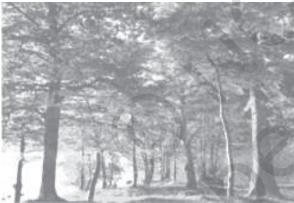
Figure 5.3 : Deciduous Forests

These are the most widespread forests in India. They are also called the monsoon forests. They spread over regions which receive rainfall between 70-200 cm. On the basis of the availability of water, these forests are further divided into moist and dry deciduous.