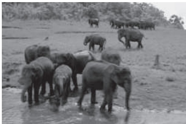
Figure 5.7 : Elephants in their Natural Habitat