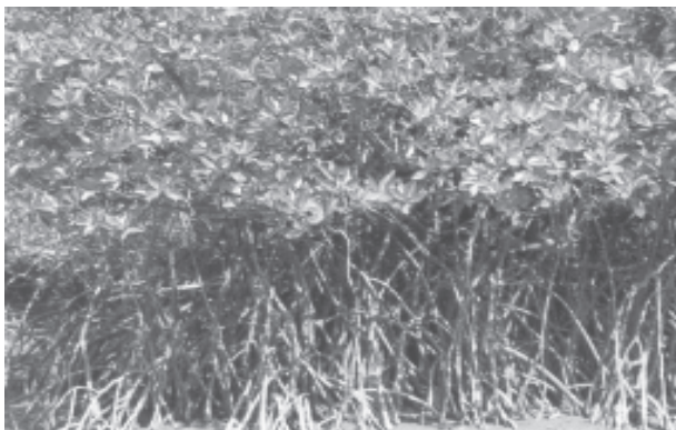
Figure 5.6 : Mangrove Forests

They consist of a number of salt-tolerant species of plants. Crisscrossed by creeks of stagnant water and tidal flows, these forests give shelter to a wide variety of birds.