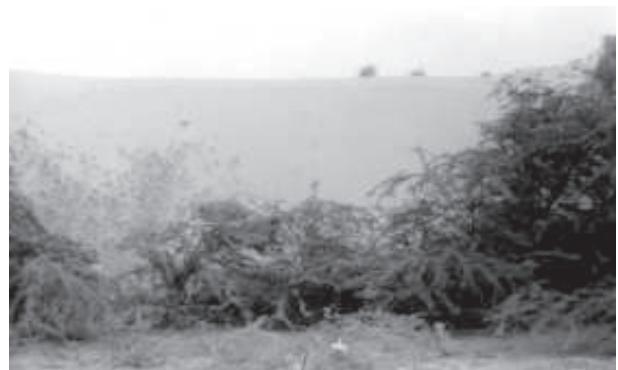
Figure 5.4 : Tropical Thorn Forests

Tropical thorn forests occur in the areas which receive rainfall less than 50 cm. These consist of a variety of grasses and shrubs. It includes semi-arid areas of south west Punjab, Haryana, Rajasthan, Gujarat, Madhya Pradesh and Uttar Pradesh. In these forests, plants remain leafless for most part of the year and give an expression of scrub vegetation. Important species found are babool , ber , and wild date palm, khair , neem , khejri , palas , etc. Tussocky grass grows upto a height of 2 m as the under growth.