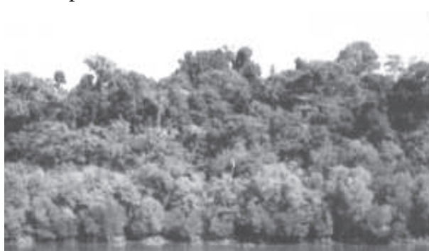
Figure 5.1 : Evergreen Forest

The semi evergreen forests are found in the less rainy parts of these regions. Such forests have a mixture of evergreen and moist deciduous trees. The undergrowing climbers provide an evergreen character to these forests. Main species are white cedar, hollock and kail.