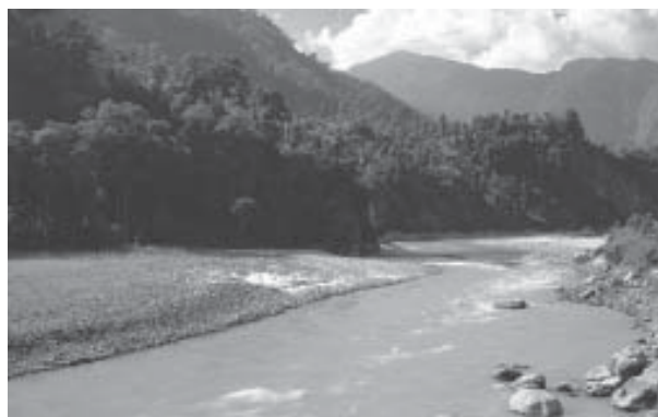
Figure 3.1 : A River in the Mountainous Region

2006) in this class . Can you, then, explain the reason for water flowing from one direction to the other? Why do the rivers originating from the Himalayas in the northern India and the Western Ghat in the southern India flow towards the east and discharge their waters in the Bay of Bengal?