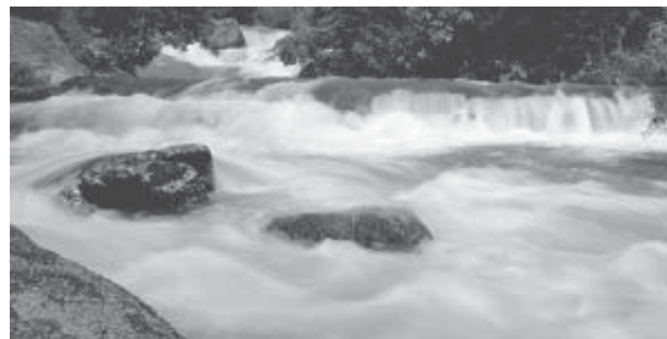
Figure 3.3 : Rapids

The Himalayan drainage system has evolved through a long geological history. It mainly includes the Ganga, the Indus and the Brahmaputra river basins. Since these are fed both by melting of snow and precipitation, rivers of this system are perennial. These rivers pass through the giant gorges carved out by the erosional activity carried on simultaneously with the uplift of the Himalayas. Besides deep gorges, these rivers also form V-shaped valleys, rapids and waterfalls in their mountainous