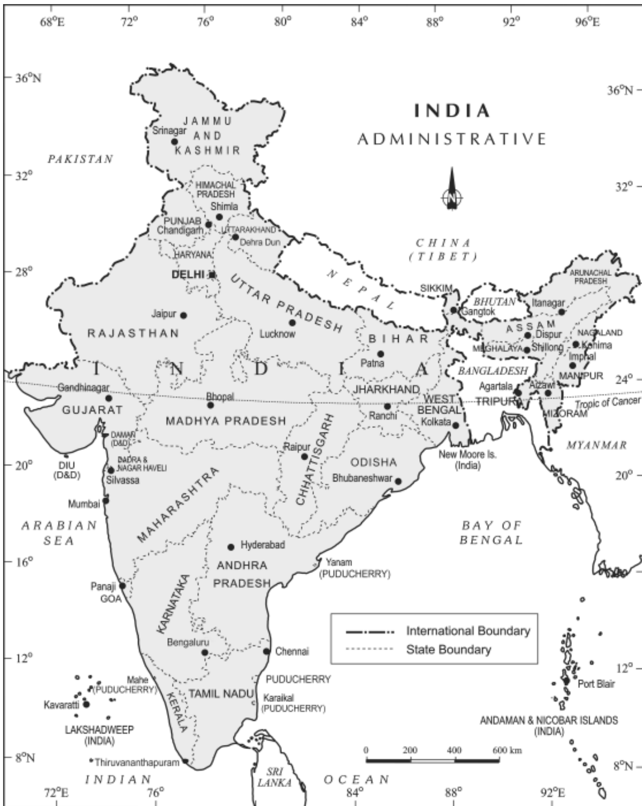
Figure 1.1 : India : Administrative Divisions