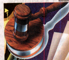
repudiate the same," said the president of north district

While rejecting the girl's insurance claim, the company alleged her ailment was not disclosed at the time of taking the policy.