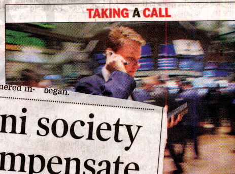
TAKING A CALL

Now those tele-service providers who the unnerving AS will land in jail to check the menace. On July 13, 2006, had ordered in- began.