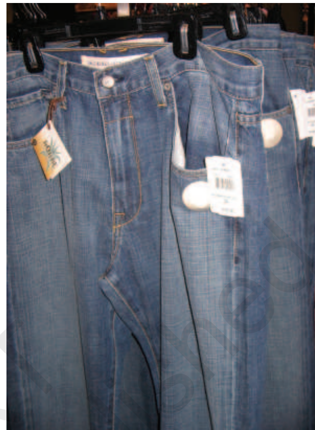
Jeans produced in developing countries being sold in USA for Rs 6500 ($145)

The products are supplied to the MNCs, which then sell these under their own brand names to the customers. These large MNCs have tremendous power to determine price, quality, delivery, and labour conditions for these distant producers.