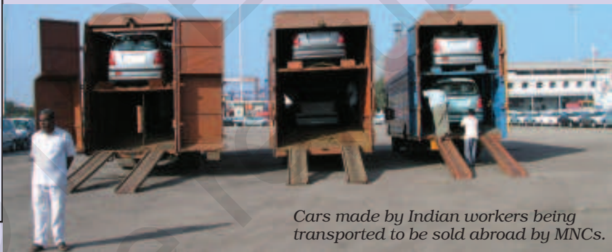
Cars made by Indian workers being transported to be sold abroad by MNCs.