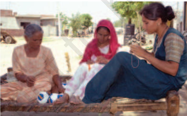
Women at home in Ludhiana making footballs for large MNCs

There's another way in which MNCs control production. Large MNCs in developed countries place orders for production with small producers. Garments, footwear, sports items are examples of industries where production is carried out by a large number of small producers around the world.