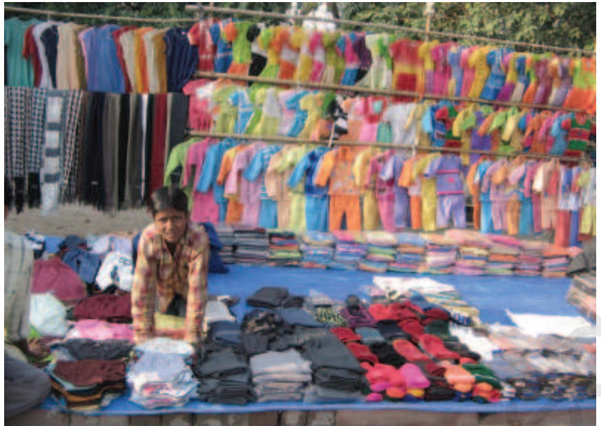
Small traders of readymade garments facing stiff competition from both the MNC brands and imports.

In general, with the opening of trade, goods travel from one market to another. Choice of goods in the markets rises. Prices of similar goods in the two markets tend to become equal. And, producers in the two countries now closely compete against each other even though they are separated by thousands of miles! Foreign trade thus results in connecting the markets or integration of markets in different countries.