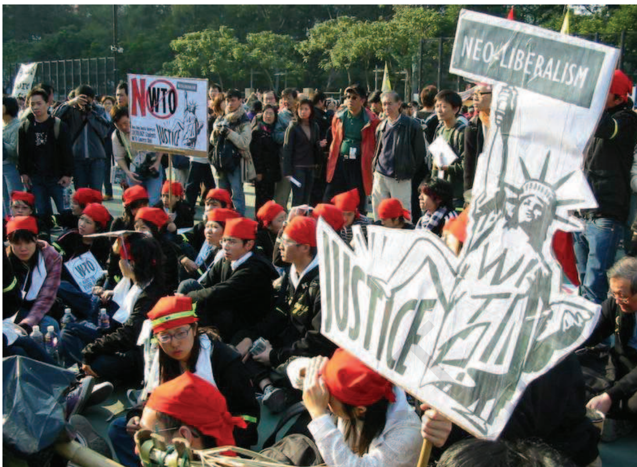
A demonstration against WTO in Hong Kong, 2005