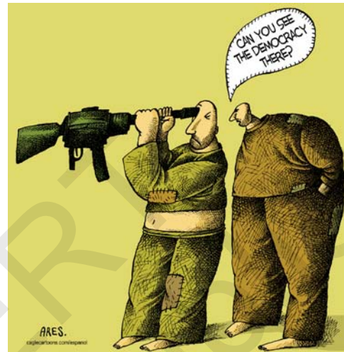
Seeing the democracy