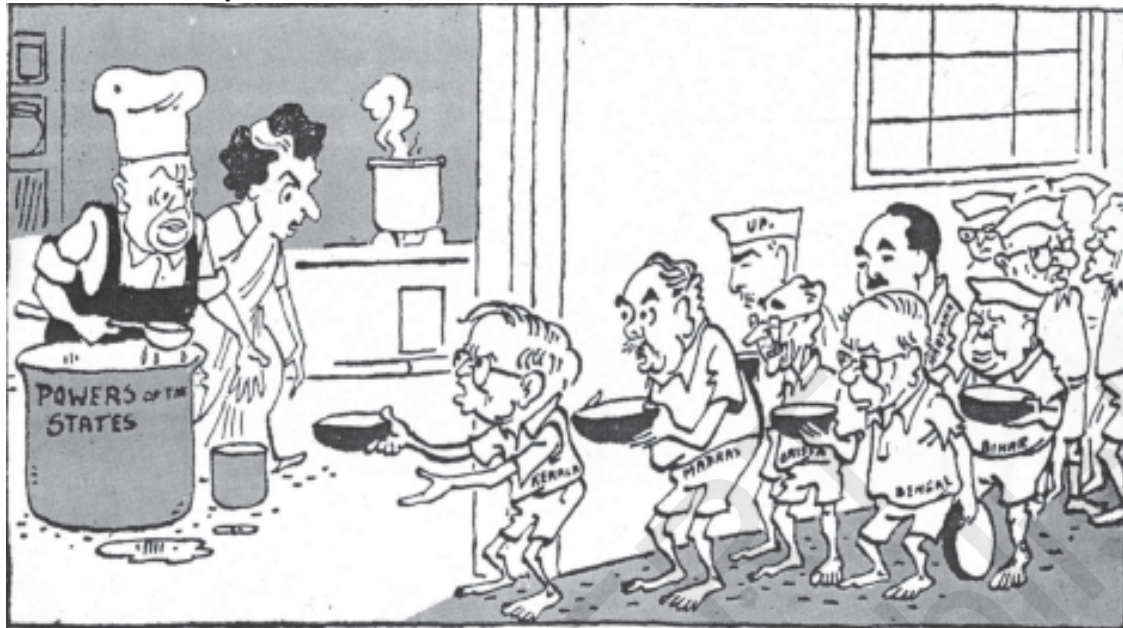
© Kutty - Laughing with Kutty