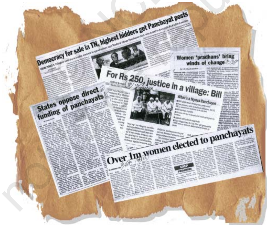
What do these newspaper clippings have to say about efforts of decentralisation in India?

Prime Minister runs the country. Chief Minister runs the state. Logically, then, the chairperson of Zilla Parishad should run the district. Why does the D.M. or Collector administer the district?