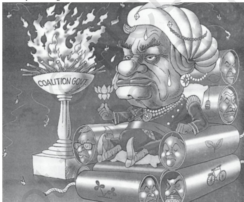
© Ajith Niman - India Today Book of Cartoons

Here are two cartoons showing the relationship between Centre and States. Should the State go to the Centre with a begging bowl? How can the leader of a coalition keep the partners of government satisfied?