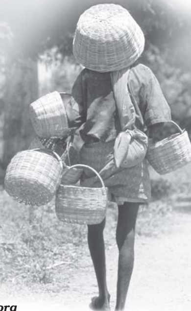
Basket-seller from Coorg