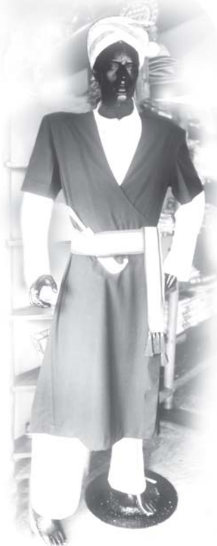
Traditional Coorgi dress

some showers thrown in for good measure. The air breathes of invigorating coffee. Coffee estates and colonial bungalows stand tucked under tree canopies in prime corners.