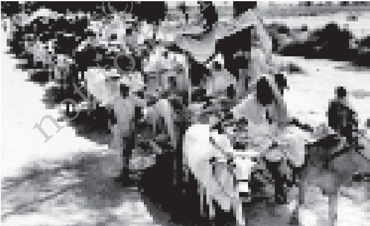
Fig. 14.4 On carts with families and belongings, 1947

The narratives just presented point to the pervasive violence that characterised Partition. Several hundred thousand people were killed and innumerable women raped and abducted. Millions were uprooted, transformed into refugees in alien lands. It is impossible to arrive at any accurate estimate of casualties: informed and scholarly guesses vary from 200,000 to 500,000 people. In all probability, some 15 million had to move across hastily constructed frontiers separating India and Pakistan. As they stumbled across these “shadow lines” – the boundaries between the two new states were not officially known until two days after formal independence – they were rendered homeless, having suddenly lost all their immovable property and most of their movable assets, separated from many of their relatives and friends as well, torn asunder from their moorings, from their houses, fields and fortunes, from their childhood memories. Thus stripped of their local or regional cultures, they were forced to begin picking up their life from scratch.