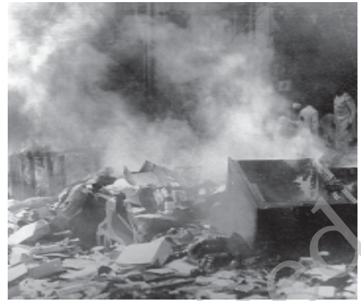
Fig. 14.2 Photographs give us a glimpse of the violence of that time.

also discuss how the history of these experiences can be reconstructed by talking to people and interviewing them, that is, through the use of oral history. At the same time, it will point out the strengths and limitations of oral history. Interviews can tell us about certain aspects of a society's past of which we may know very little or nothing from other types of sources. But they may not reveal very much about many matters whose history we would then need to build from other materials. We will return to this issue towards the end of the chapter.