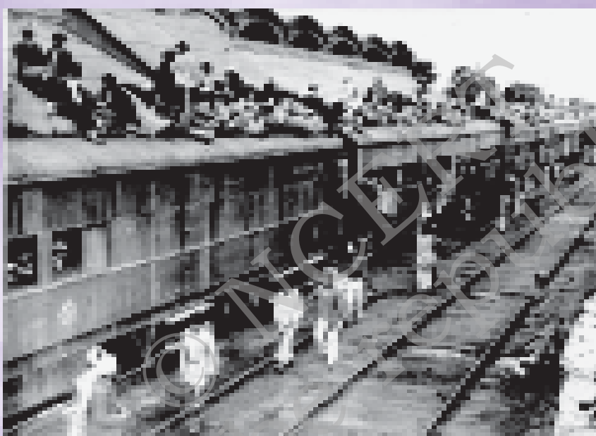
Fig. 14.3 Over 10 million people were uprooted from their homelands and forced to migrate.

“That ‘Stop!’ sounded like a brute order to me and I instantly thought now I’ll be gone. This Sikh will finish me off. But there was no escaping the situation, so I stopped. The burly Sikh came running to me and gave me a mighty hug. Eyes moist, he said, ‘For quite a few years now, I have not met a Punjabi Musalman . I have been longing to meet one but you cannot find Punjabi-speaking Musalmans here.’”