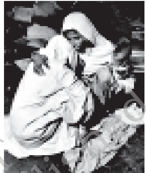
Fig. 14.12 Women console each other as they hear of the death of their family members. Males died in larger numbers in the violence of rioting.

In one instance, a Sikh youth who had run amuck during the Partition persuaded a massacring crowd to let him take away a young, beautiful Muslim girl. They got married, and slowly fell in love with each other. Gradually memories of her parents, who had been killed, and her former life faded. They were happy together, and a little boy was born. Soon, however, social workers and the police, labouring assiduously to recover abducted women, began to track down the couple. They made inquiries in the Sikh’s home-district of Jalandhar; he got scent of it and the family ran away to Calcutta. The social workers reached Calcutta. Meanwhile, the couple’s friends tried to obtain a stay-order from the court but the law was taking its ponderous course. From Calcutta the couple escaped to some obscure Punjab village, hoping that the police would fail to shadow them. But the police caught up with them and began to question them. His wife was expecting again and now nearing her time. The Sikh sent the little boy to his mother and took his wife to a sugar-cane field. He made her as comfortable as he could in a pit while he lay with a gun, waiting for the police, determined not to lose her while he was alive. In the pit he delivered her with his own hands. The next day she ran high fever, and in three days she was dead. He had not dared to take her to the hospital. He was so afraid the social workers and the police would take her away.