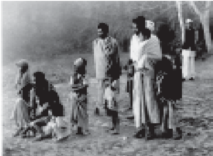
Fig. 14.11 Villagers of a riot-torn village awaiting the arrival of Mahatma Gandhi