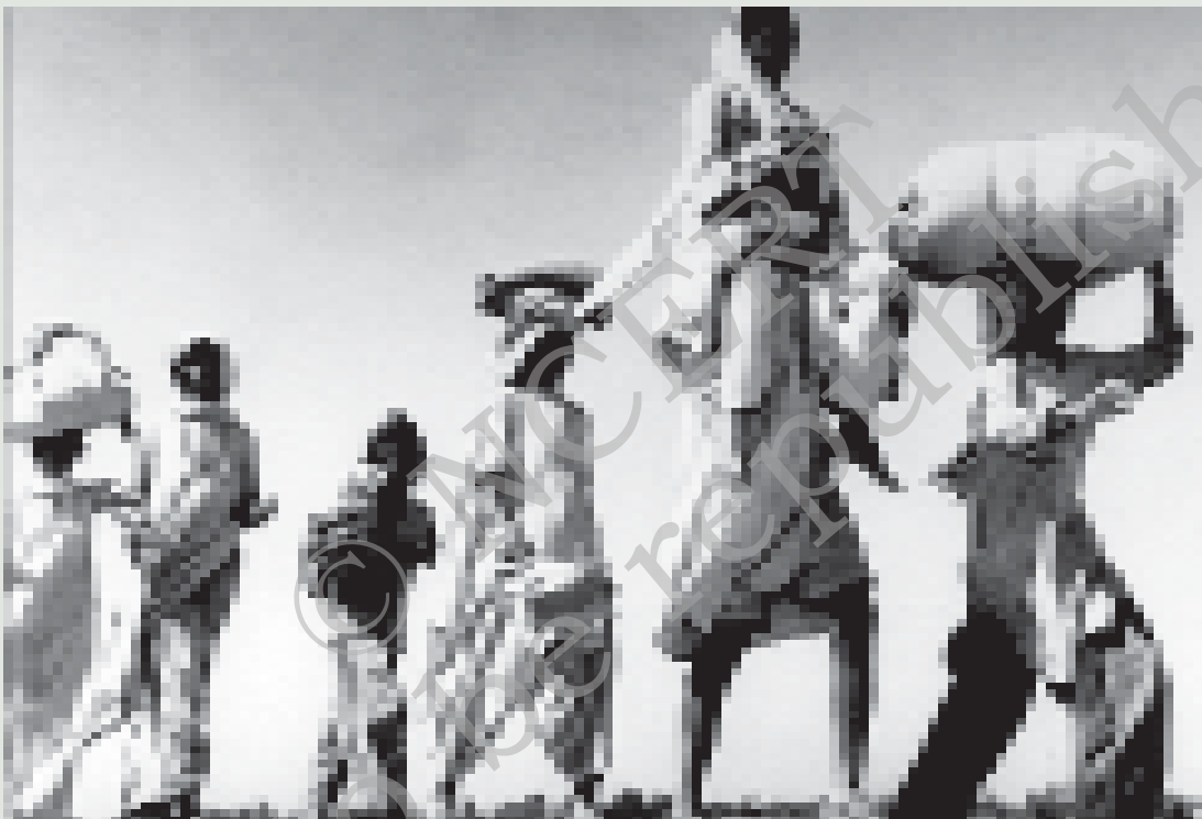
Fig. 14.1 Partition uprooted millions, transforming them into refugees, forcing them to begin life from scratch in new lands.

We know that the joy of our country's independence from colonial rule in 1947 was tarnished by the violence and brutality of Partition. The Partition of British India into the sovereign states of India and Pakistan (with its western and eastern wings) led to many sudden developments. Thousands of lives were snuffed out, many others changed dramatically, cities changed, India changed, a new country was born, and there was unprecedented genocidal violence and migration.