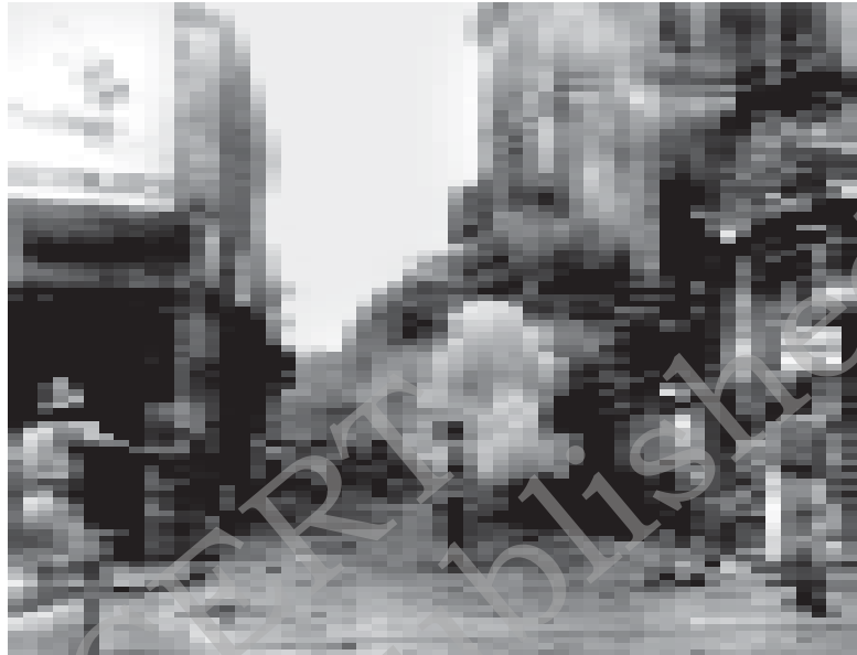
Fig. 14.9 Through those blood-soaked months of 1946, violence and arson spread, killing thousands.