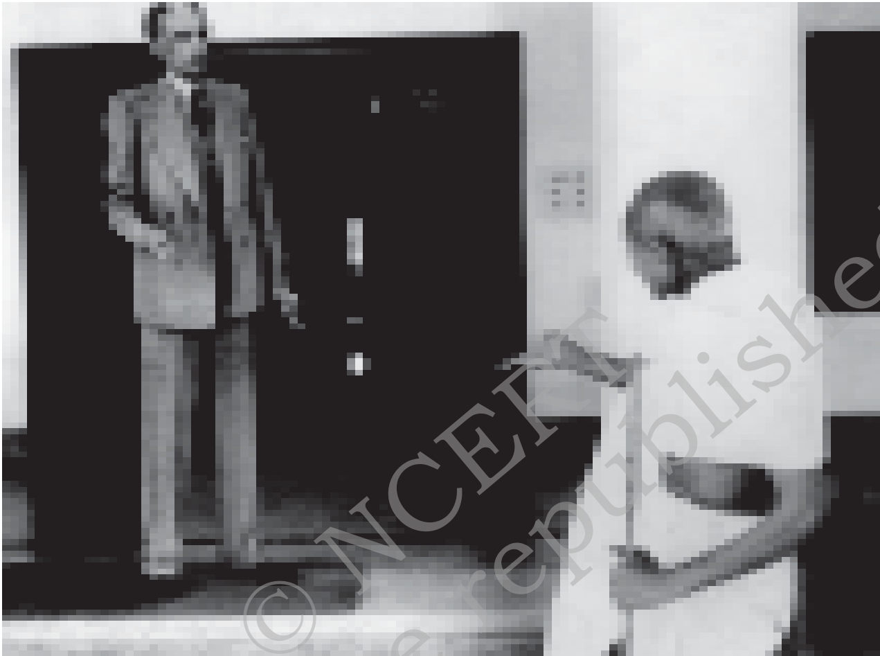
Fig. 14.6 Mahatma Gandhi with Mohammad Ali Jinnah before a meeting with the Viceroy in November 1939

largely Muslims. The British had no intention of annoying the Unionists who still controlled the Punjab government and had been consistently loyal to the British.